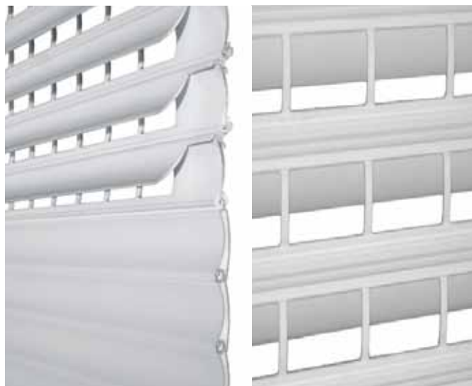
JalouRoll combined with roller shutter curtain an opened venetian blind function.