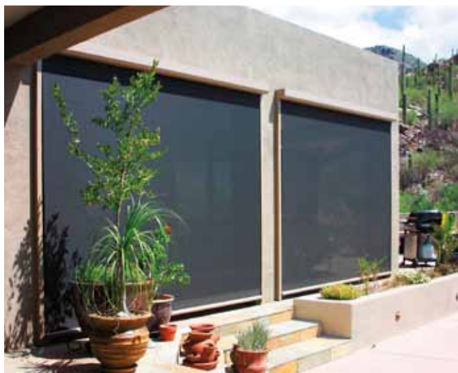
ALUKON - ZipTex the textile curtain

ALUKON offers a large variety of shading possibilities. Benefit of the available colours and materials to create your functional facade.