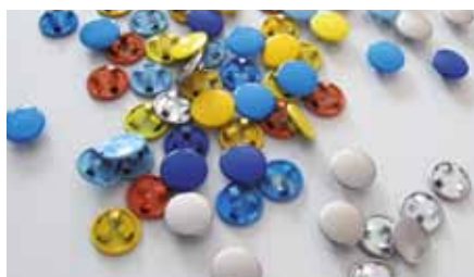
Steel cover caps – available powder-coated